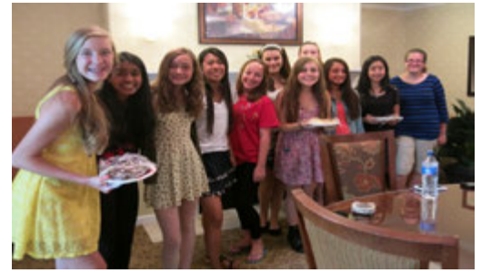
Super sweet Senior Girl Scouts Entertain