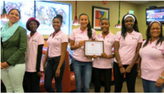
LITA counts on lovely Rosebuds at Christmas