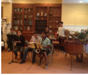
Youthful LITA Jazz Musicians