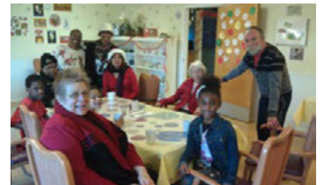
Carolers enjoy tea with residents at Greenridge Care Center in El Sobrante

Sign up for Pet Visits or Special Events. Find Opportunities under LITA of Contra Costa at volunteereastbay.org