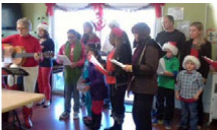
One of 14 December LITA carol visits Legacy Nursing & Rehab in Martinez