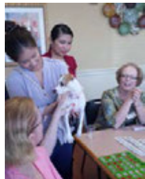
Chanel introduces Roo. Activities in Pleasant Hill